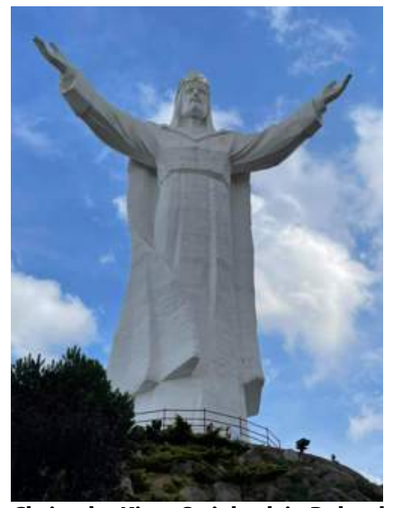
Christ the King, Swiebodzin Poland

"I learned more about having a relationship with Jesus in these past few years than I have my whole life. You are very patient with me, even when my behavior frustrates you and me. I really do want to follow Jesus, but some days, I am just scared. Thank you for helping me." This is just one of the appreciative comments by a student.