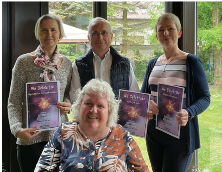
The lady on the left joined us in 2010 as a hard-core skeptic. She is now one of the most outspoken people in the group about her faith in Christ.

Drawing students into the lives of people like Joseph, David and Daniel, as well as contemporary Christian biographies, novels, leadership books and even Superhero movies, matters of the heart and soul are discussed from a variety of perspectives. Students also learn the grammar they need for their language acquisition through the curriculum developed by the Graceland team. Over the years, a recurring comment from the students has been that 'they came for the English, stayed for the community, but were transformed by the content.'