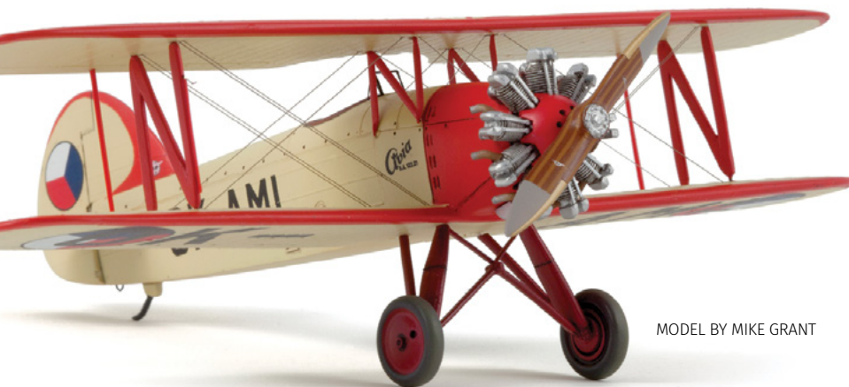
MODEL BY MIKE GRANT

Humans have the remarkable ability to not merely represent reality through artistic means, but to imagine a different reality and communicate it through creative means. The Greeks called this poesis – from which we get our English word poetic, meaning “to make,” or the formative production of something new being brought into being. Part of what it means to claim that we are created in the image of God is also to affirm the calling and role of imaging our Creator by becoming a sub-creator in imaginative ways.