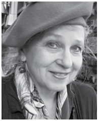
By Ansophie Joubert

The time of Passover is chosen by the cycle of the moon. It is always a full moon and somewhat light, even in the darkness amongst the trees in the Garden of Gethsemane. The garden was relatively small – a few olive trees and an oil press to make olive oil.